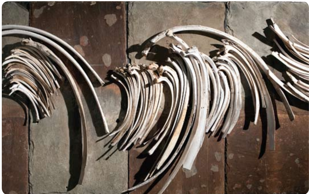
Alison Coates Inland Clouds (Detail) 2010 129cm x 50cm Sheep & cattle bones, slates & wire