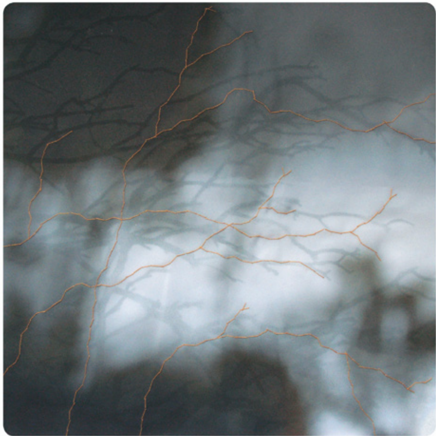
Patricia Casey, Impasse , 2009, photographic print on georgette, embroidery detail, 49 x 54 cm