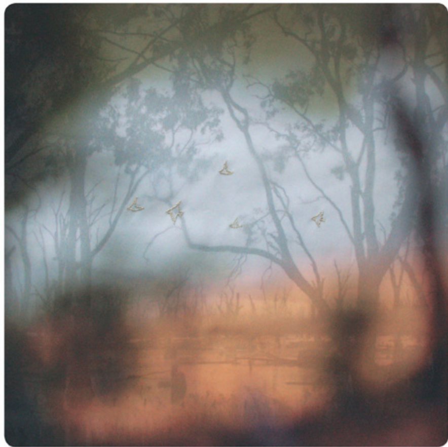
Patricia Casey Eroks 2008 photographic print on georgette, embroidery detail 49 x 54 cm

three little queen street chippendale nsw 2008 tel 9318 2992 ng@ngart.com.au www.ngart.com.au ng art gallery tue - sat 11am - 10pm mission tue - fri 11am - 10pm sat 9am - 10pm