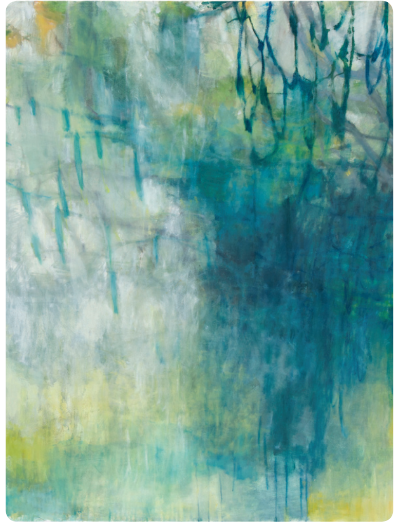
Mariola Smarzak: Composition V 2010 150 x 120cm Oil on canvas